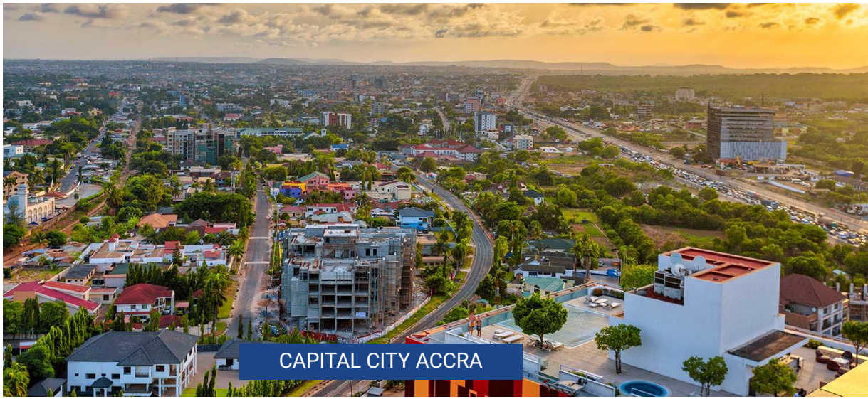
CAPITAL CITY ACCRA