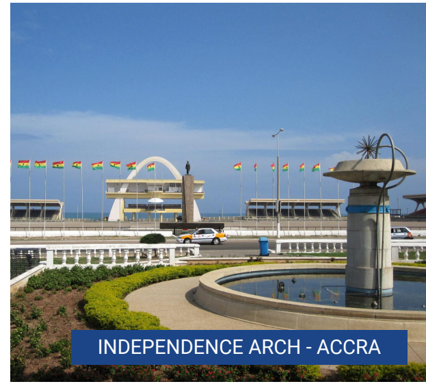
INDEPENDENCE ARCH - ACCRA