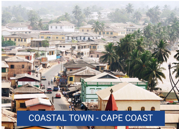
COASTAL TOWN - CAPE COAST