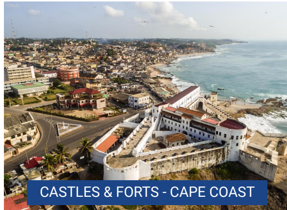
CASTLES & FORTS - CAPE COAST